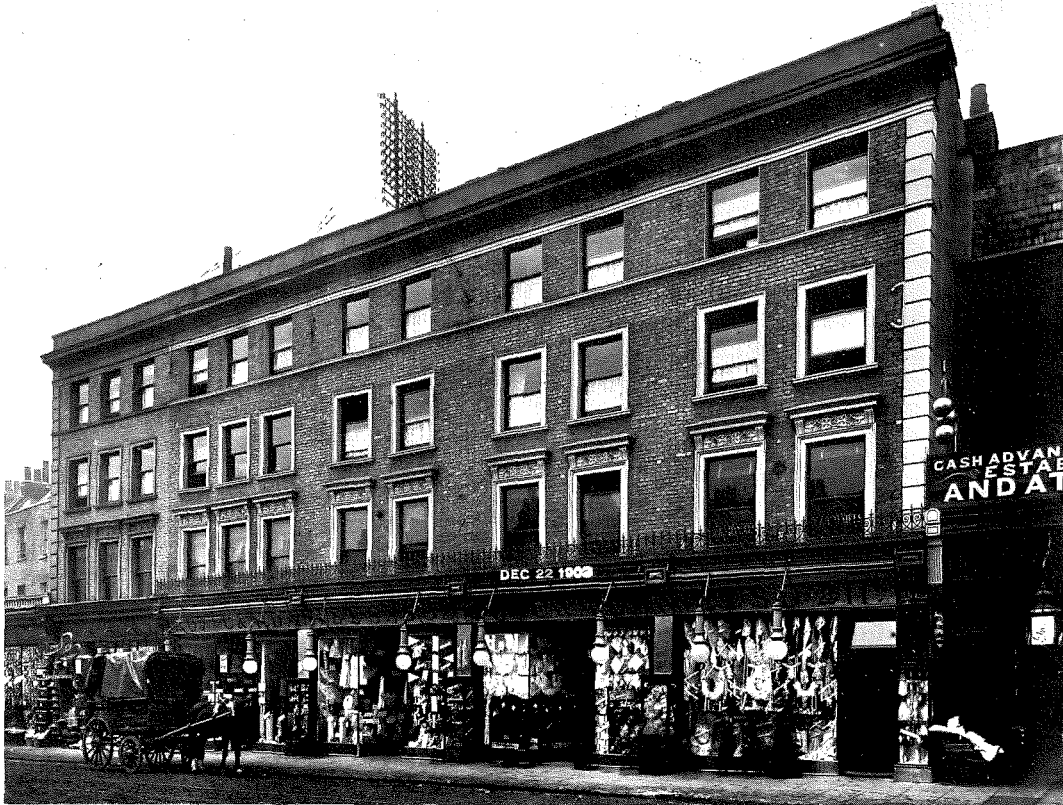
This picture shows one part of C & A Daniels store in Kentish Town in 1903. No 209 is on the site of one of the old Morgan farmhouses, reputedly built on the site of the medieval St Pancras Chapel-of-Ease. Owl Bookshop now occupies 211.