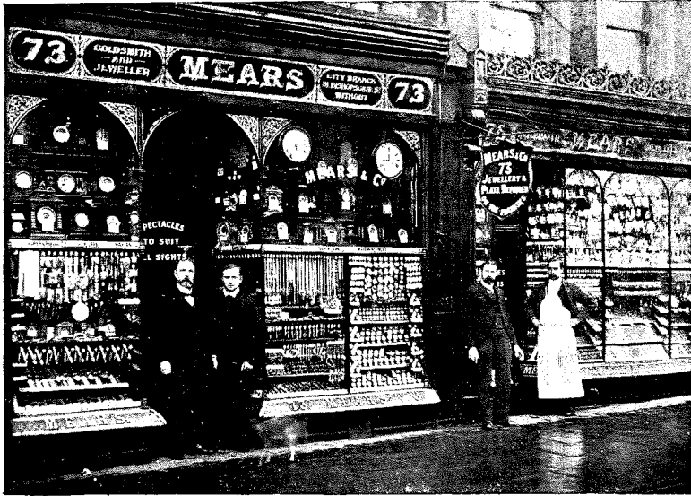
Series by the Scottish Photographic Touring and Pictorial Post Card Coy., Glasgow.