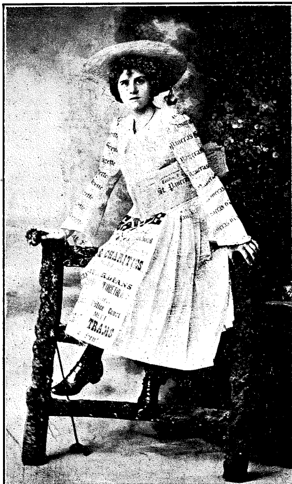
The St. Pancras Gazette is always Up-to-Date.—Buy it.