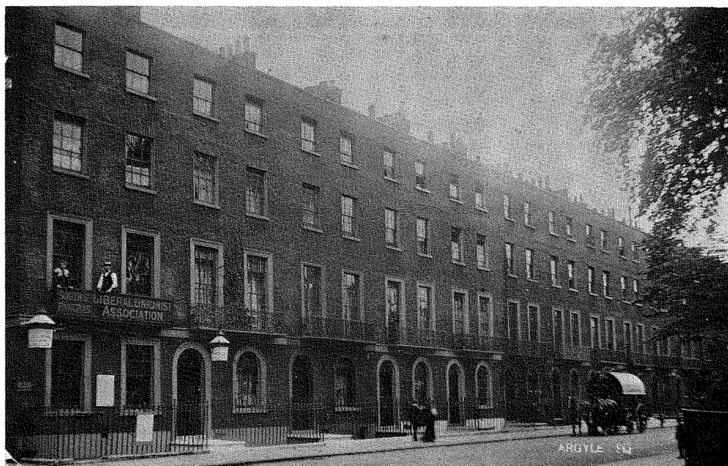
A 1906 postcard showing Argyle Square W.C.1. The South St Pancras Liberal and Unionist Headquarters is pictured with, presumably, party workers on the balcony.