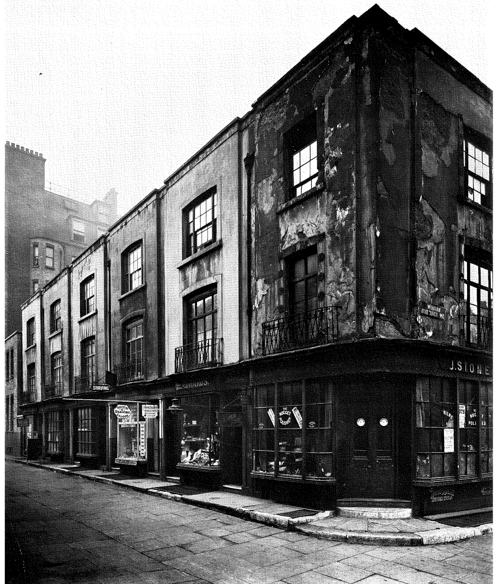
Woburn Buildings, off Woburn Place in 1922