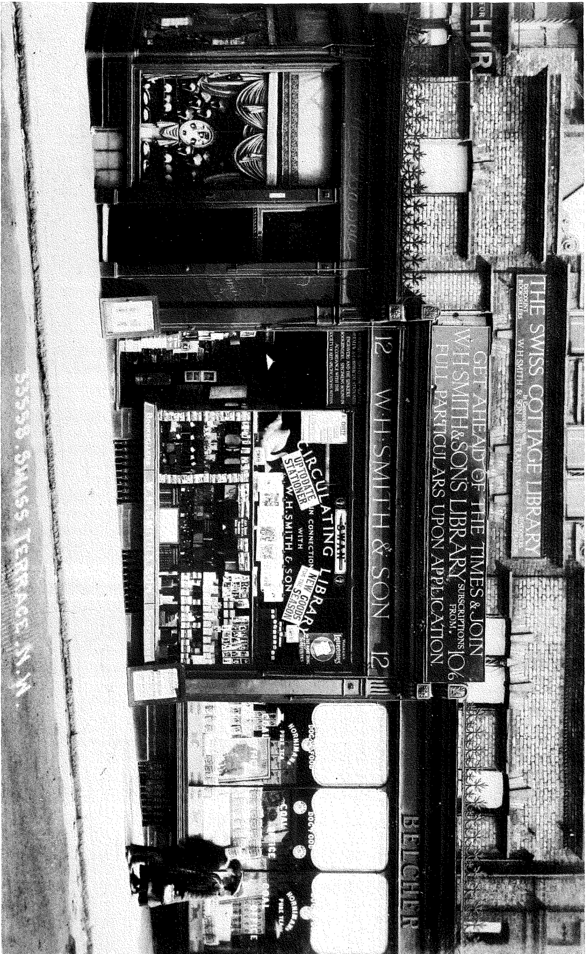
A postcard of the W.H. Smith branch at Swiss Terrace, Swiss Cottage. The date of the postmark is 1914 but underneath a magnifying glass it is possible to read that one of the placards outside the shop, for the Daily Telegraph, announces the resignation of Sir Edward Clarke. Can anyone identify the event and date?