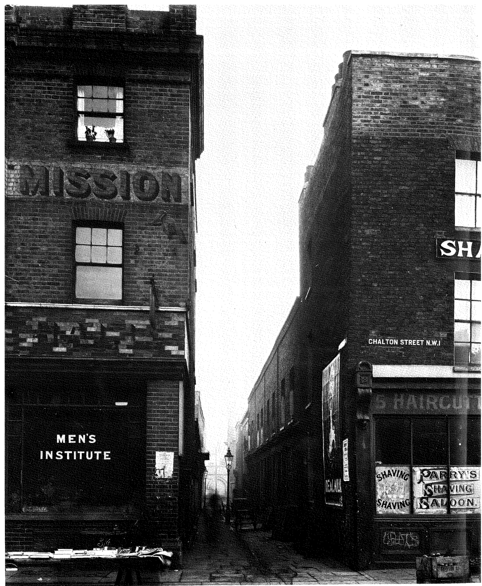
'A 1926 photograph of Weirs Passage, off Chalton Street, Somers Town.