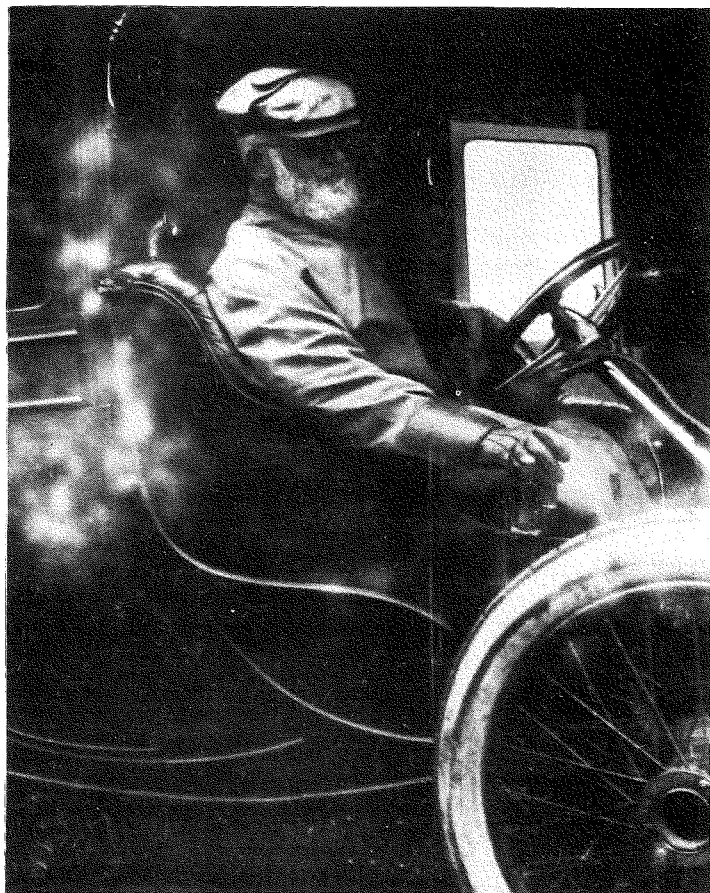
George Bernard Shaw, amongst other things a Vestryman for St Pancras, is here depicted at a Fabian summer school in 1922. From a fascinating set of postcards obtainable from the Fabian Society, 11 Dartmouth Street, S.W.1

The Exhibition, which shows the development of architectural drawings in this period, is on from 1st March to 30th April.