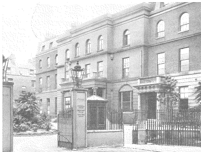
The old Tavistock House

(Nearest tube station Finchley Road - cross the road, walk north and after 30 yards turn right into steep path which leads to Netherhall Gardens. Follow this street and then turn right into Nutley Terrace. About 70 yards to the left, before the crossroads with Maresfield Gardens, you will see Netherhall House, with its circular drive in front. Parking restrictions locally apply until 8pm.)