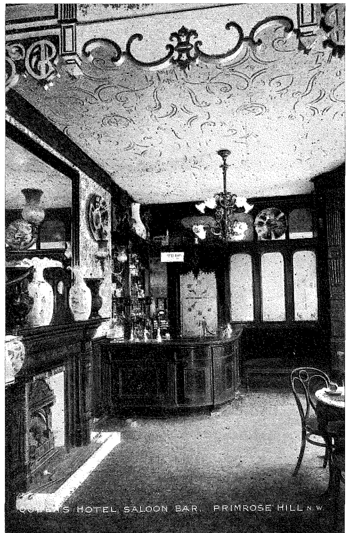
An unusual interior photograph of c.1905, of the Queens Hotel, Primrose Hill Road.