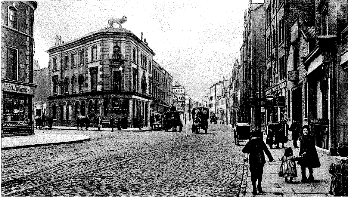
King's Cross Road c.1905.