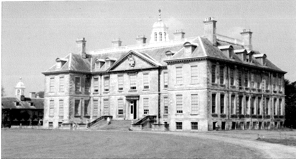
Belton House, Lincolnshire.