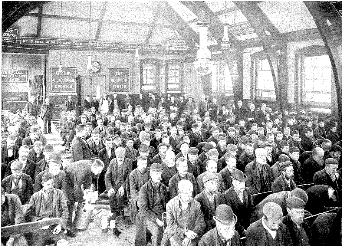
The Field Lane Refuge was a well-known institution in Holborn which, in a modern form, survives today. This picture, probably pre-First World War, shows inmates as very docile indeed, or perhaps giving thanks for the food they are about to get.